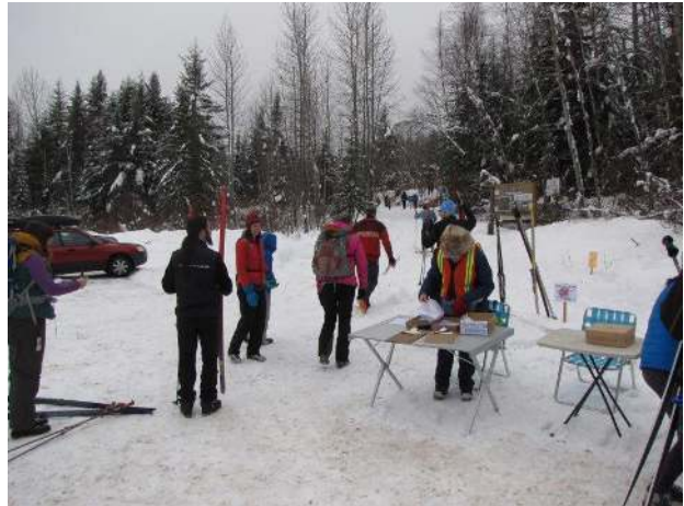
Birchleg Registration and start