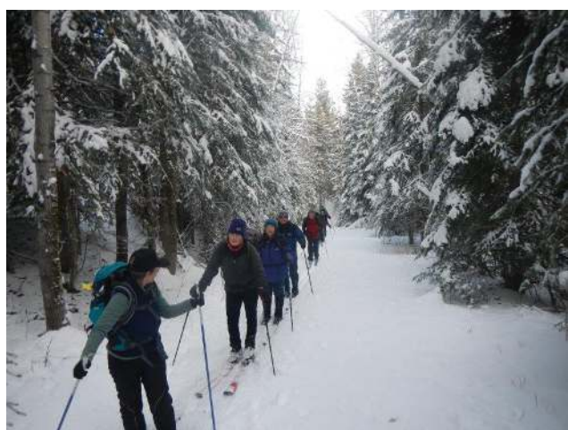
A day on Tabor Mountain Trails