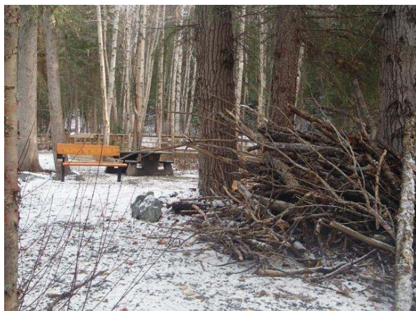
Debris piles along the trail ready for removal