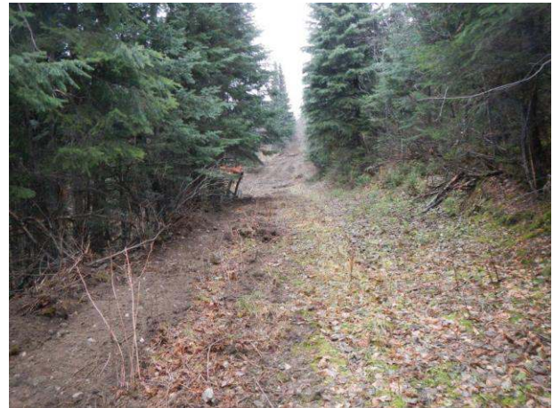
Cat work on Troll Lake Trail

X-country skiing may be a winter sport, but there is a lot of work to maintain or upgrading the trails in preparation for the winter. This Summer the ski group have been given approval to do work on several trails in preparation of a even greater x-country skiing this winter. The plans for this summer work bees include: