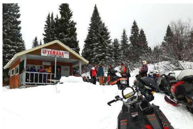
Yamaha Cabin meeting place for refreshments