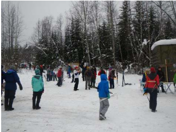
Birchleg Event Gathering

Several x-country ski trips were organized by the Hickory Wing Ski Touring Club during the winter, usually on Sundays and or once during the middle of the week. Most of the trips utilized Tabor Mountain trail and all those new bridges put in on the trails last year by this group.