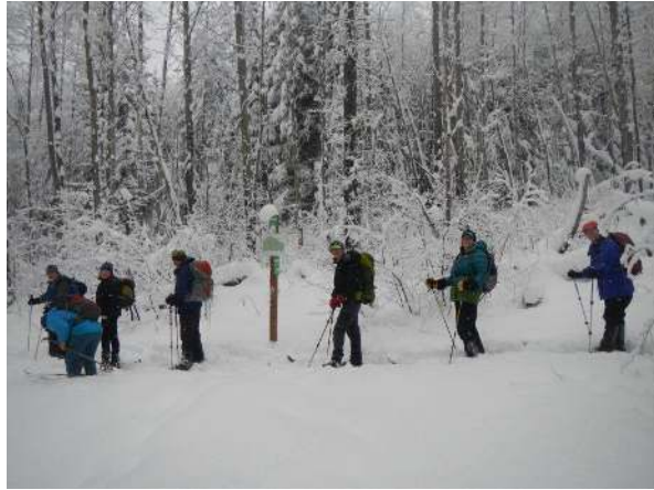
The group heading to Troll Lake cabin