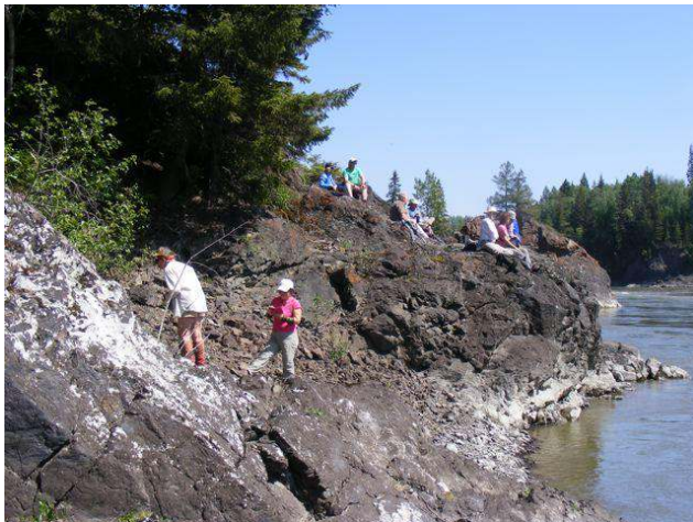
Hike along Fraser River