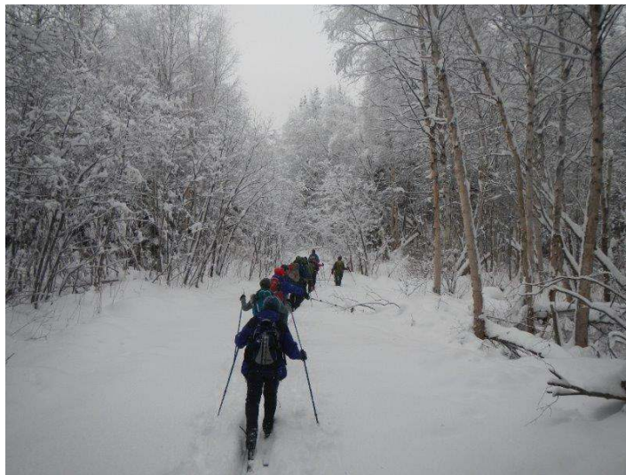
Great day on skies on Tabor Mountain