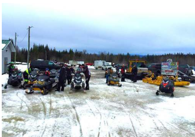
Getting organized and ready to go