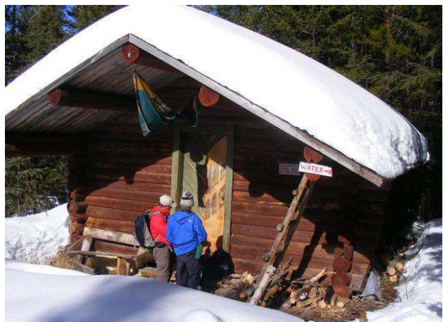
Trek on Tabor Mountain