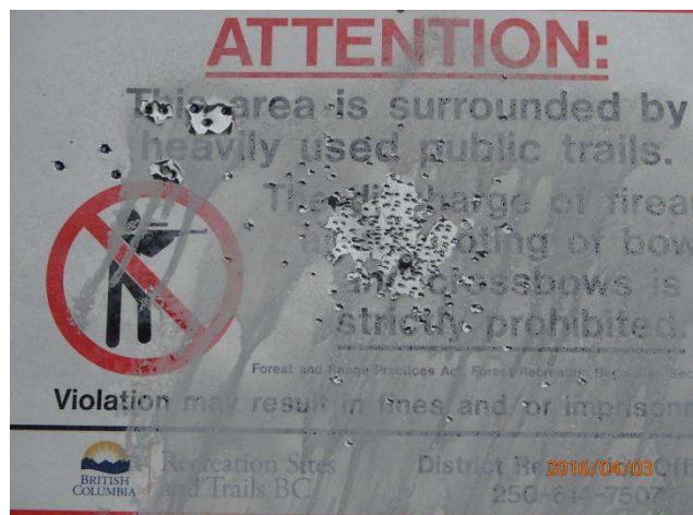
No Shooting sign Painted over & shot up