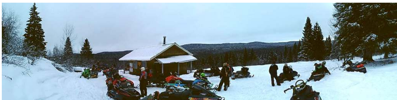
Yamaha Cabin and area rest area