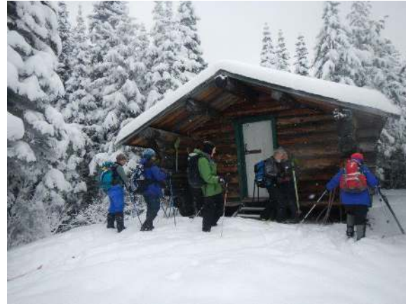
Troll Lake cabin