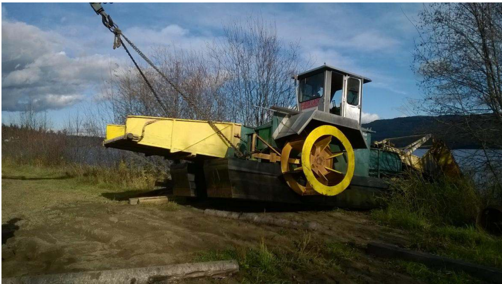
Tabor Lady at dry dock

TLCS is working with UNBC to gather key lake information and analyse the years of information gathered from the lake. The goal of the research focuses on developing a strategy to manage the lake phosphates and other components to bring the lake up to its former glory.