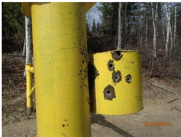
Gate lock cover shot up