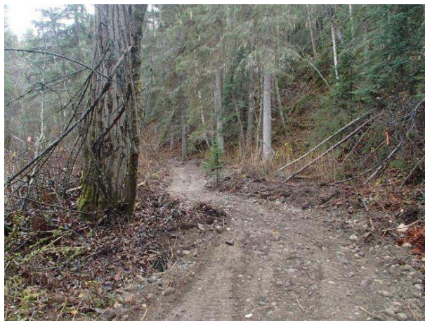
Roughed out trail extension

TMRS is in partnership with Spinal Cord Injury BC to host a special day at the trail head called Access North Day . The celebration will be held on July 23, 2016 between 10:30 and 2:00 at the GWL Mobility Nature Trail Parking Lot. There will be demo ATV's, motorized wheel chairs, food, and of course the grand opening of the GWL trail expansion by special guests.