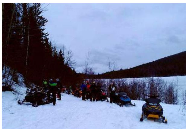
Frost lake check point