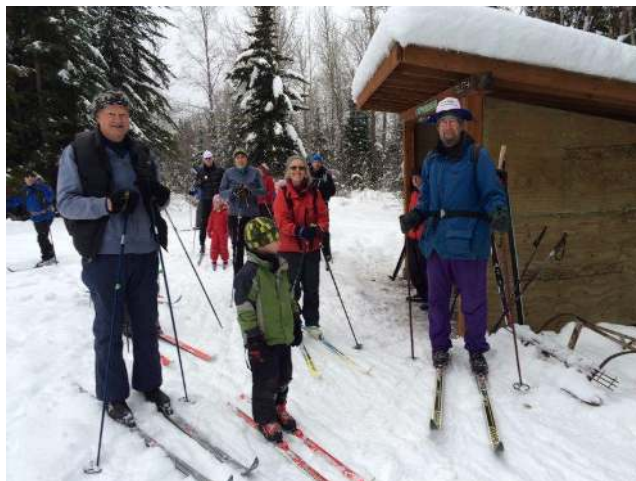
Happy Skiers during the day of the Birchleg